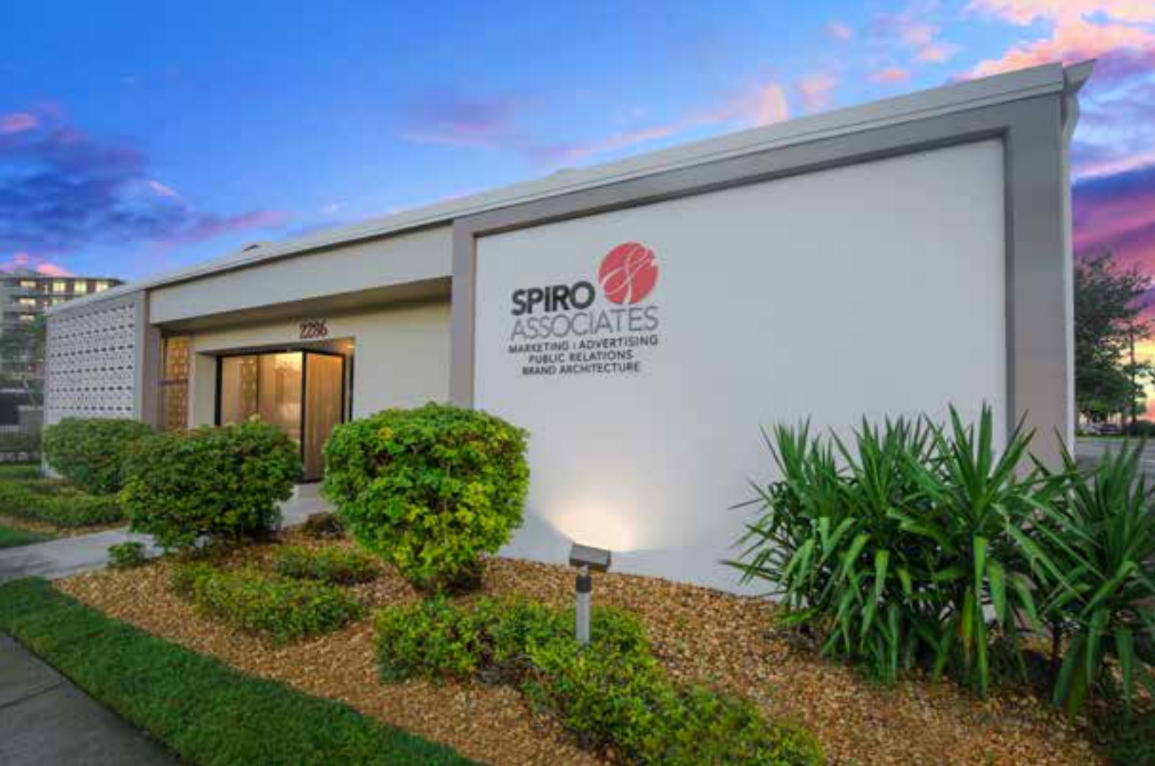
Today – Spiro & Associates' downtown office in Fort Myers, FL.